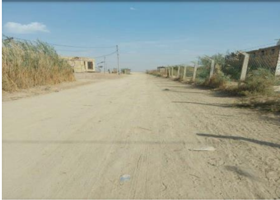
Figure 2: Current Situation at these Villages