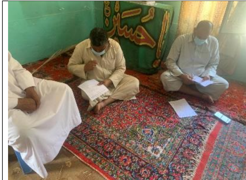
Public Consultations at Al-Mezareej Village