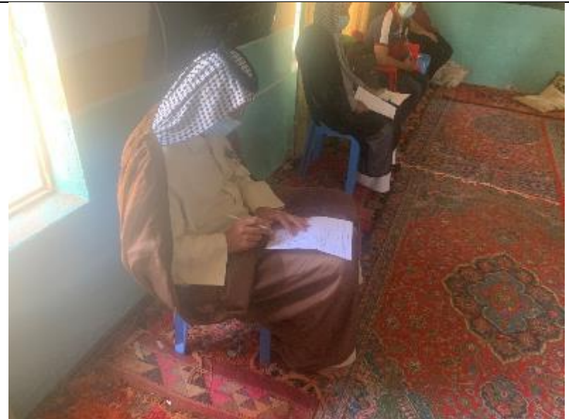
Public Consultations at Al-Mezareej Village