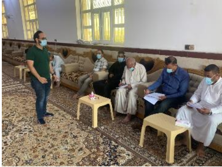
Public Consultations at Al-Ataa Village