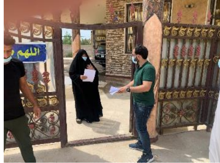
Public Consultations at Al-Ataa Village